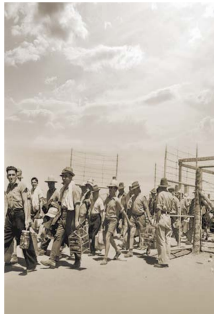
From the developing display on WWII in the Italian Pavilion.