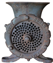
The salami meat mincer.

The change of ownership of the Tastes of New Italy Café has created an opportunity to look at the shared space that houses the Museum. Referring to 'Turmoil - Tragedy to Triumph: The Story of New Italy' , the Museums group would like to rethink the wall displays referencing the family displays in the centre of the Museum. Several strategies are being discussed including the reinterpretation of a settler kitchen using implements like salami meat grinders and butter churns. A plan is being drawn up and a grant application will hopefully secure funds to take this further. If you would like to be a part of this process please contact us. We continue to meet on Museums Monday, the second Monday of every month.