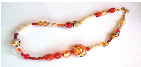
Murano beads from the Casa Vecchia Gift Shop.

The Gift Shop has donated two of the three fantastic prizes in this year's Carnevale Italiano Raffle. Second prize is an elegant Scala Leather handbag while third prize is a choice of a beautiful Murano bead necklace from the Gift Shop selection. First prize is a $2000 travel voucher donated by Summerland Travel Lismore! Tickets are available from the Casa Vecchia Gift Shop. Tickets will also be sold at Carnevale Italiano - Il Centro. They will be drawn after 3pm. Buona fortuna!